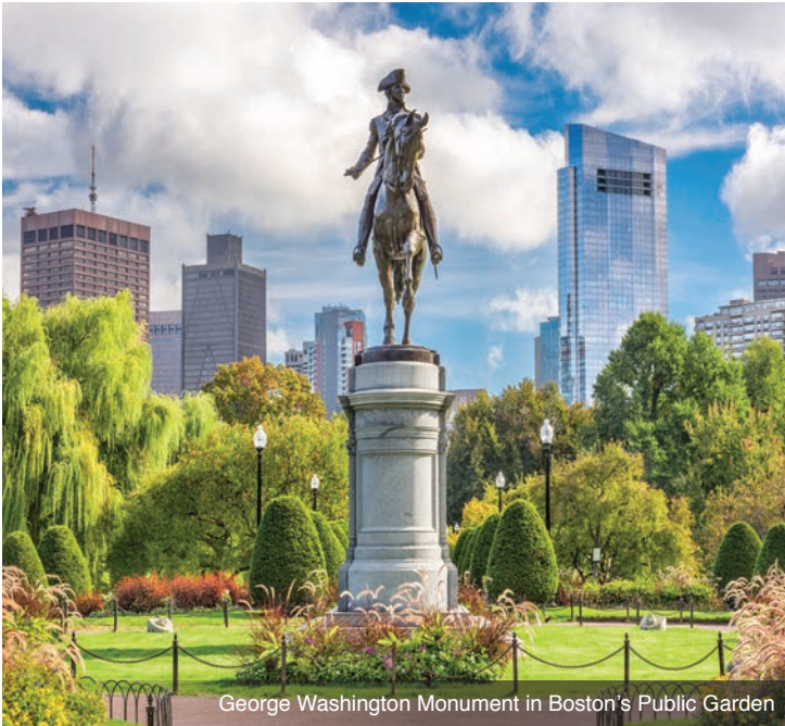
George Washington Monument in Boston's Public Garden