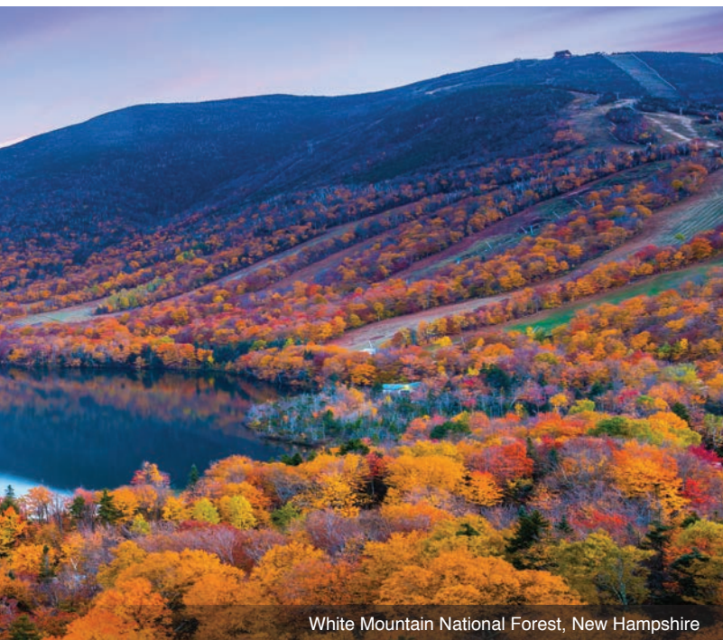
White Mountain National Forest, New Hampshire